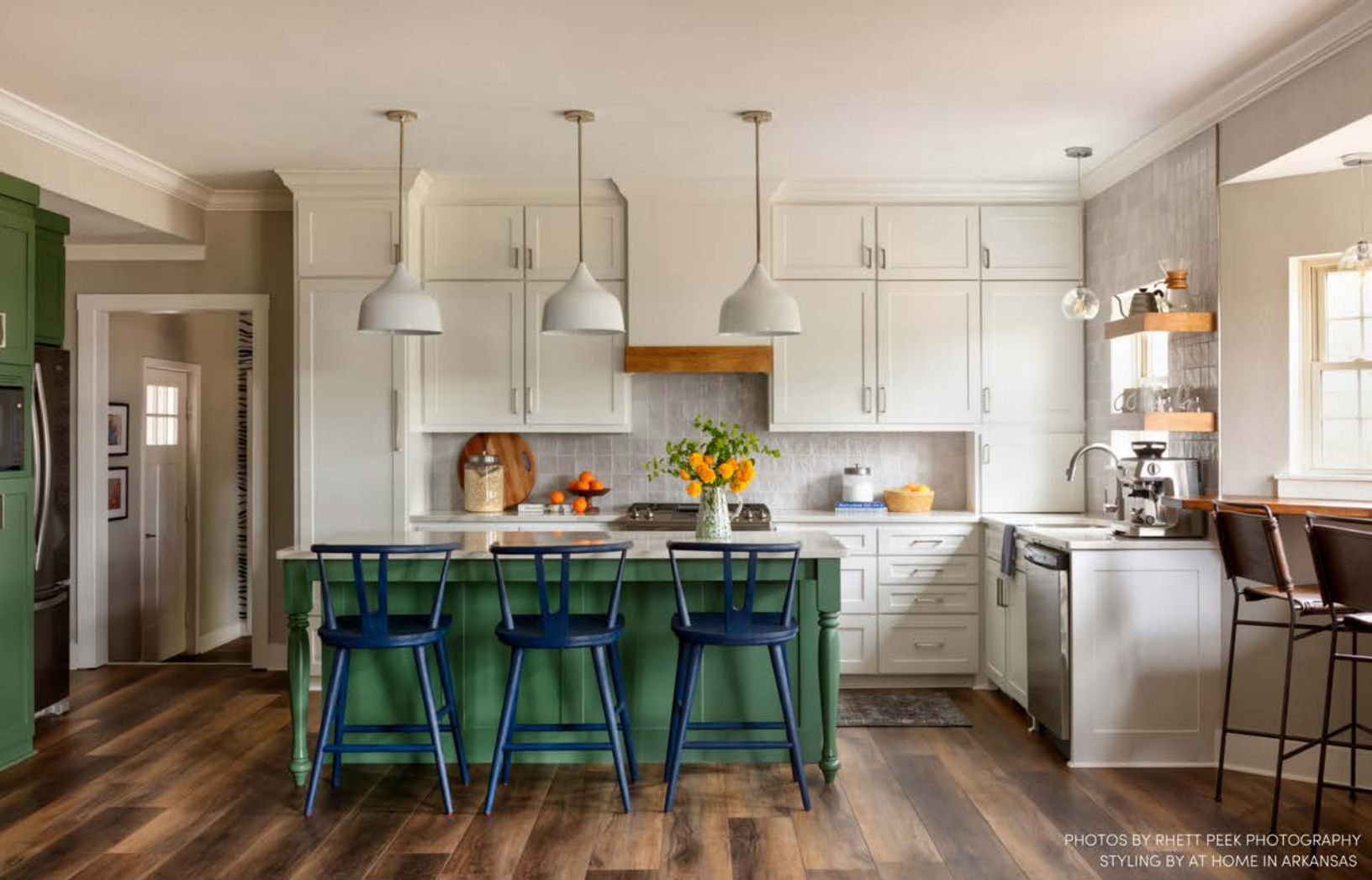
STYLING BY AT HOME IN ARKANSAS