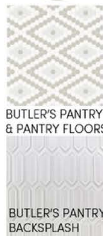
BUTLER'S PANTRY & PANTRY FLOORS