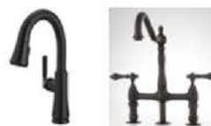
PREP SINK MAIN SINK