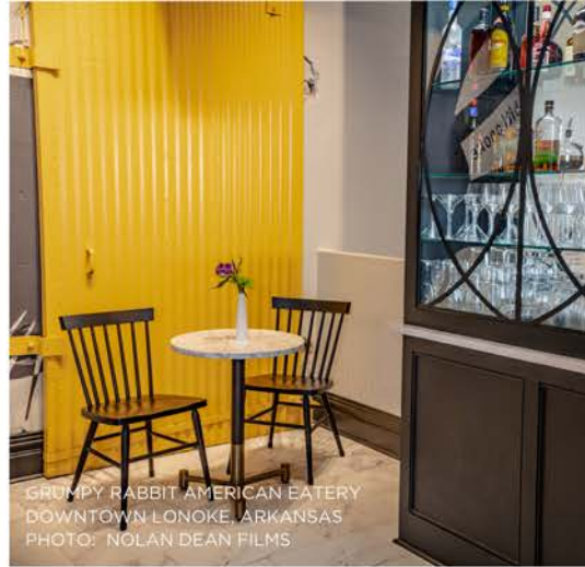
GRUMPY RABBIT AMERICAN EATERY DOWNTOWN LONOKE, ARKANSAS