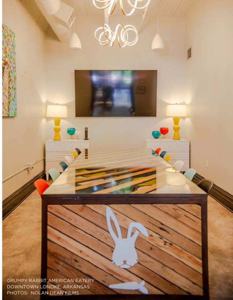
GRUMPY RABBIT AMERICAN EATERY DOWNTOWN LONOKE, ARKANSAS PHOTOS: NOLAN DEAN FILMS