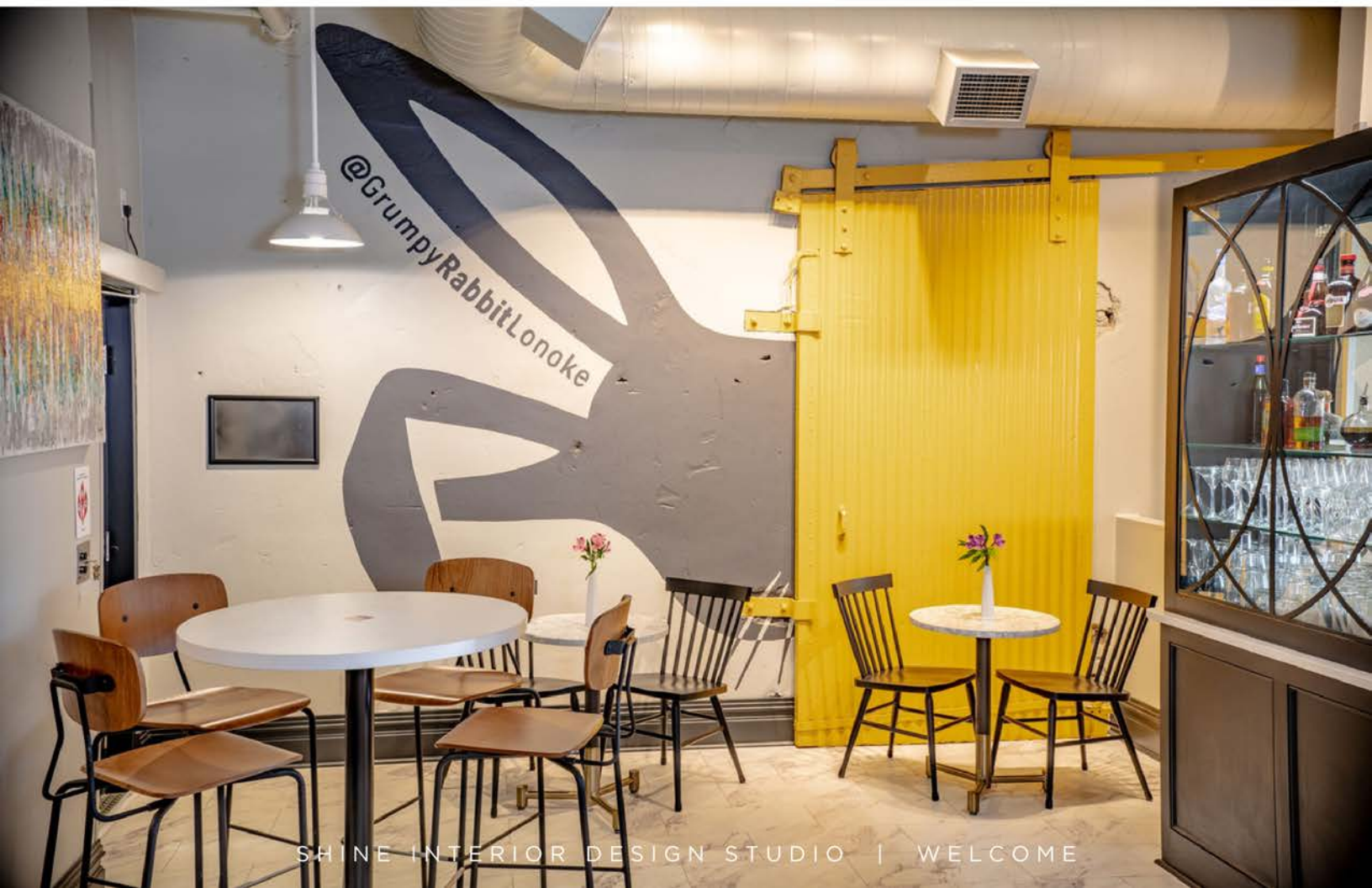
SHINE INTERIOR DESIGN STUDIO | WELCOME