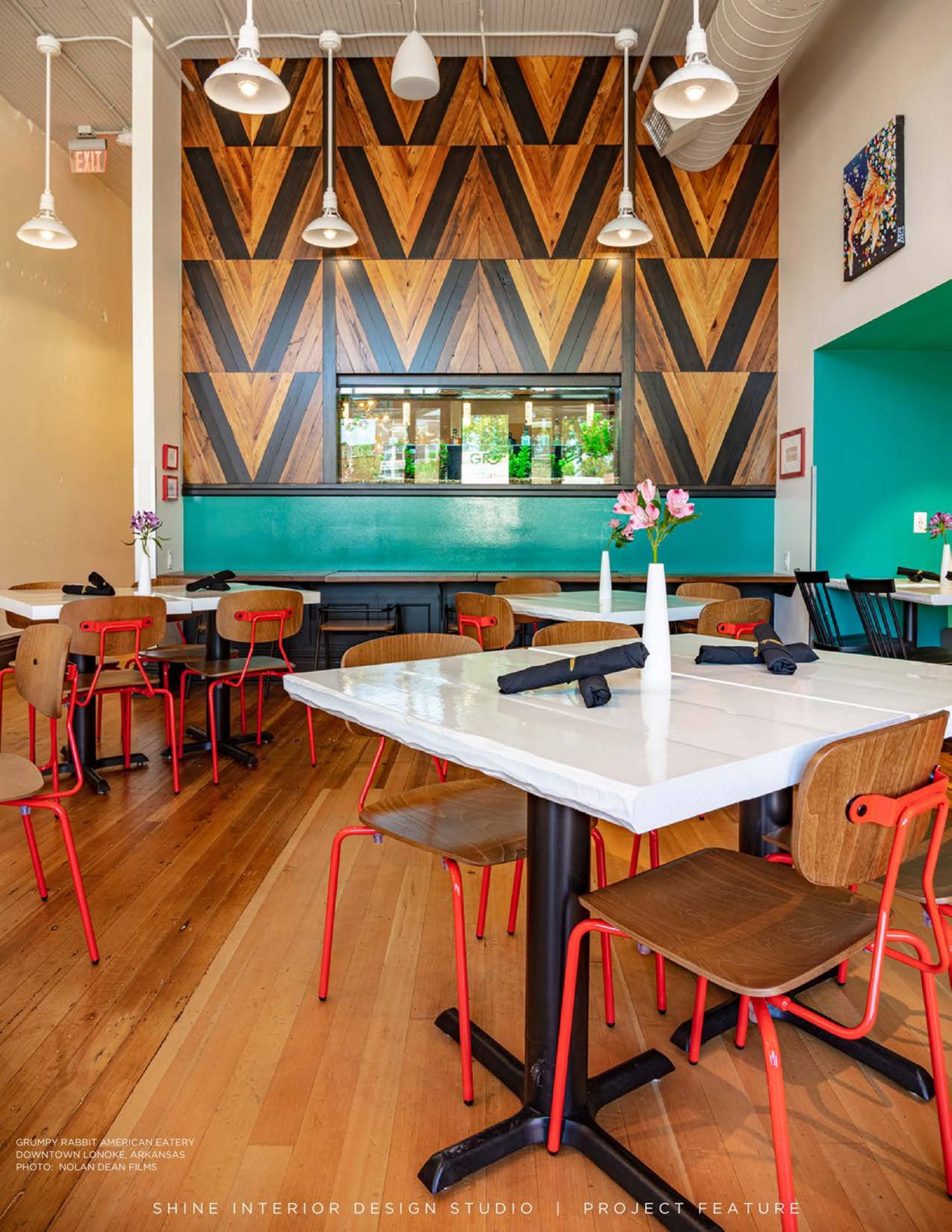
GRUMPY RABBIT AMERICAN EATERY DOWNTOWN LONOKE, ARKANSAS