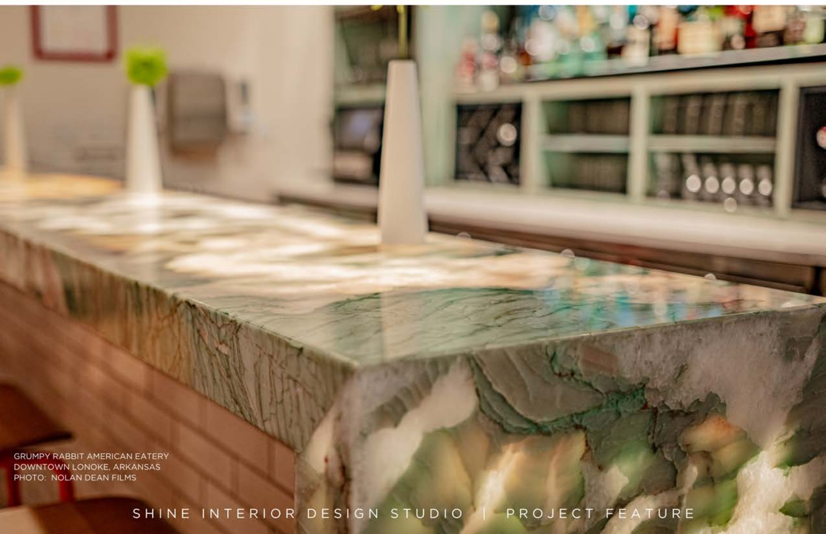
GRUMPY RABBIT AMERICAN EATERY DOWNTOWN LONOKE, ARKANSAS