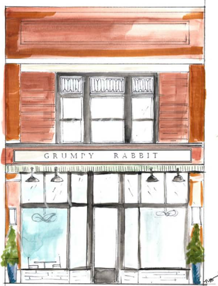
GRUMPY RABBIT RESTAURANT